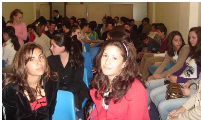
Some 70 participants were present from all the Omathes and Senior Sunday Schools. Above, some of the girls, and below, some of the boys present.